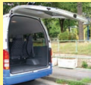
Wide baggage space