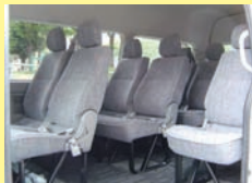
Wide spacing between the seats